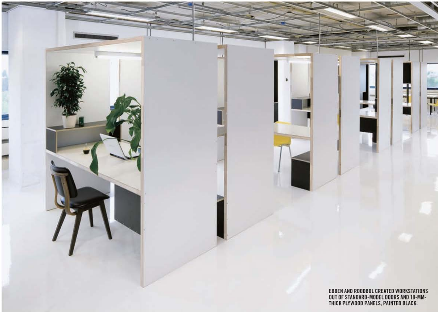
EBBEN AND ROODBOL CREATED WORKSTATIONS OUT OF STANDARD-MODEL DOORS AND 18-MM-THICK PLYWOOD PANELS, PAINTED BLACK.